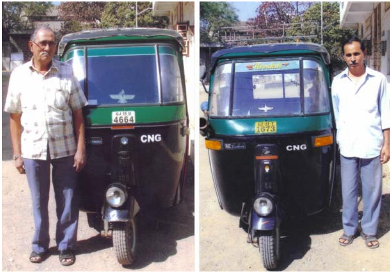
Two of eight, CNG conversion auto-rickshaws by BSF Trust