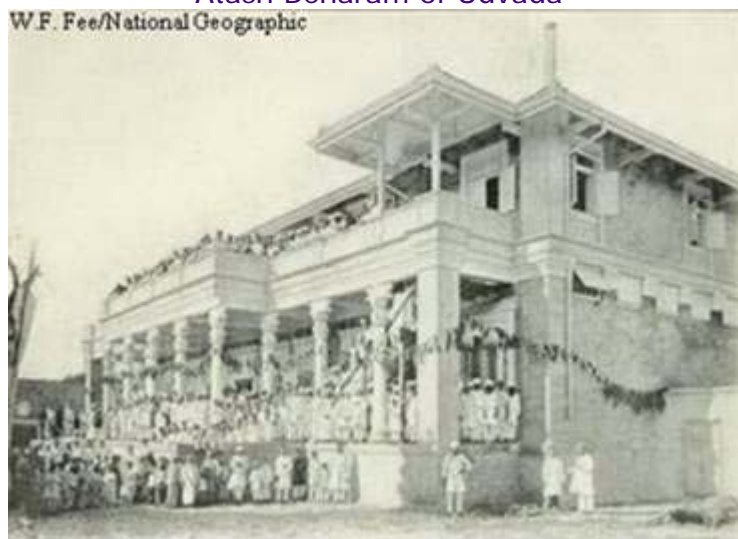
Fire Temple at Udvada Photograph dated 1909