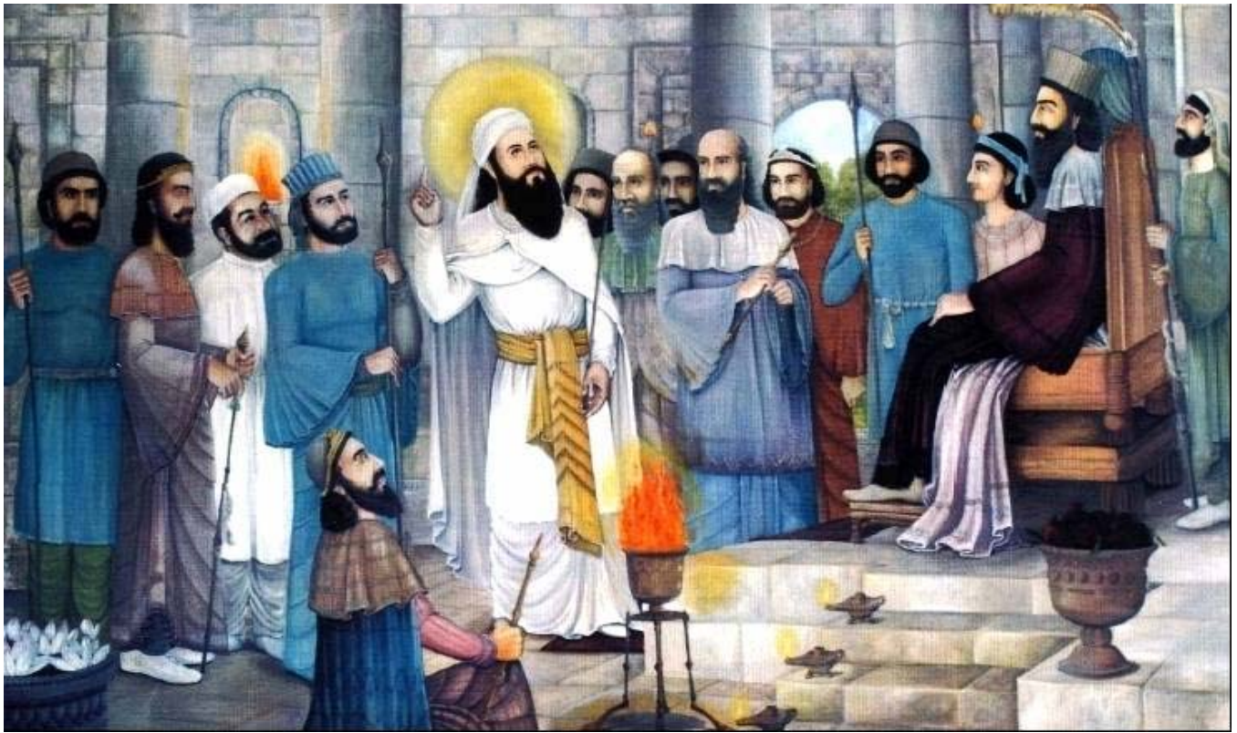
Zarthusaheb in the Darbar of King Vishtasp.