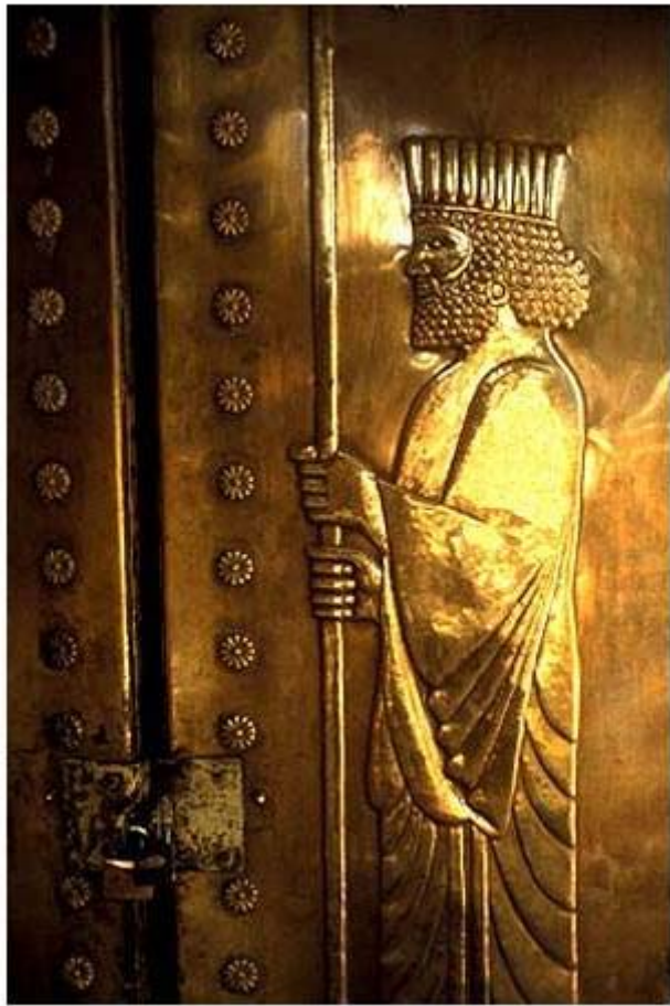
Door to the Spring Sanctuary of Ahura Mazda, Chak Chak, Yazd, Iran