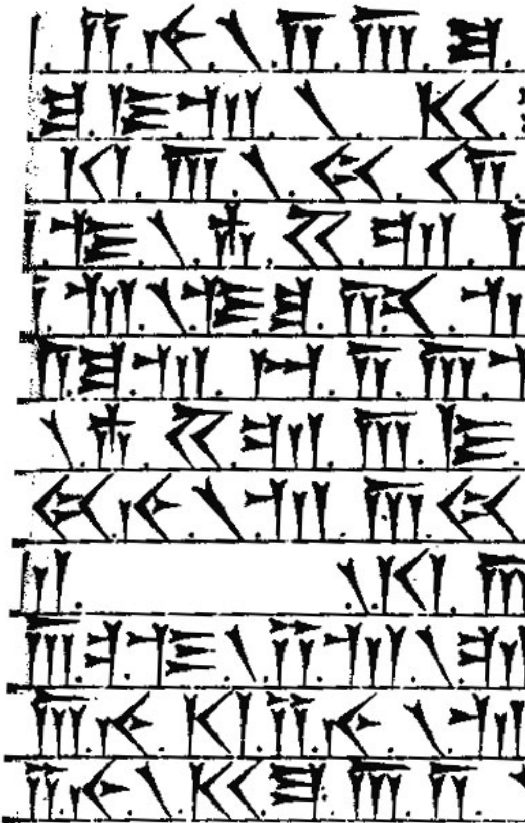
Mon of Darius—Column III, Behistun (6th century B.C.)